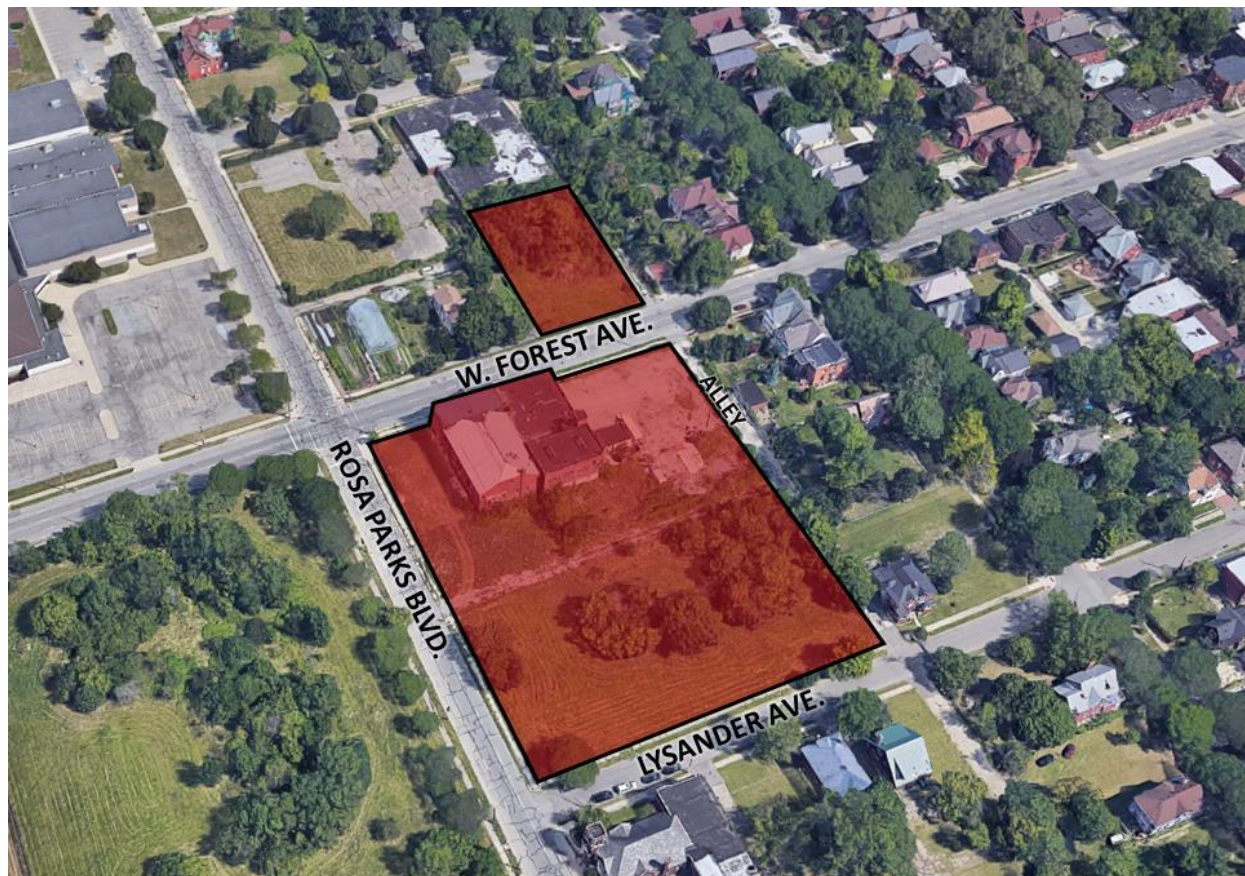
Aerial view of proposed rezoning

The site is located in City Council District 6 and measures about 3 acres. The area proposed for development is currently vacant land. The area proposed to be rezoned to maintain consistency is occupied by several vacant commercial buildings and a parking lot.