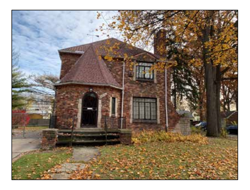
French Eclectic - 18806 Eureka Street (1933)

This two-story dwelling was built in approximately 1925-1935. Sheathed with tan and brown striated brick veneer applied to balloon frame construction, this cross-gable roof dwelling with graduated eaves. This front gable brick dwelling expresses architectural characteristics of a simplified Tudor Revival house, including its prominent projecting entry gable, its steeply pitched front façade gables, and the rounded lintels above the three first-story front façade windows. The arches of the three windows are filled with white stucco. The original front-façade windows have been replaced with double-hung vinyl windows. Other elements, however, reflect the period, such as the round brick arch over the entry door, adjacent vertical window with a brick arch lintel, raised brick front porch, and brick porch pillars. An elongated brick work detail is centered in the front entry façade. The south façade of the home has a side entry at the driveway, and the basement-level windows at the south façade are filled with glass block. The north façade gable at the second story is filled with white vinyl siding. Houses of this type became popular in the late 1920s and early 1930s all over the city of Detroit. Their blend of traditional elements with low cost proved to be an appealing combination for many families building homes in Krainz Woods.