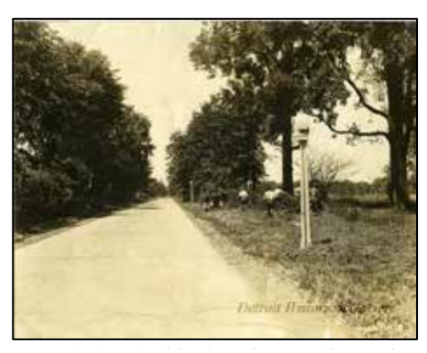
Detroit Historical Society, Seven Mile Road,

A significant development occurred in 1906, when the Detroit Terminal Railroad (DTRR) purchased property at the south side of what is now Nevada Street, running east-west, to develop its railway. While the area was still part of Hamtramck Township in 1906, Detroit's population boom of the 1910's created a demand for housing, and developers began platting new subdivisions and streets. Both the 1910 Sanborn Insurance Co. map and the Baist Co. map from 1911 do not depict streets in the area of the proposed district. The agricultural land was undocumented by the mapping companies at that time.