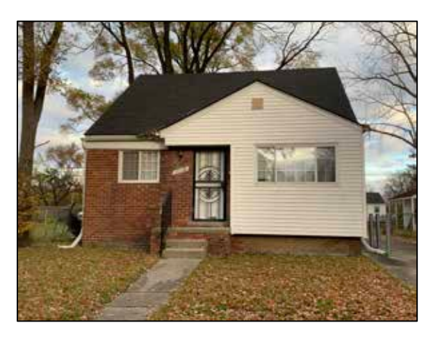
Minimal Traditional - One and one-half story - 18096 Buffalo Street (1953)

At the attic story of the north façade are two hipped-roof dormers. A sleeping porch is at the back of the second story of the house. The roof of the home is covered in light maroon-colored asphalt shingles. There is a metal weathervane at the peak of the entry tower. The house has white aluminum gutters and downspouts, and it has its original black cast iron multi-pane windows in place. The house is sited on an extra lot, allowing for a concrete driveway grass lawns and two-car garage.