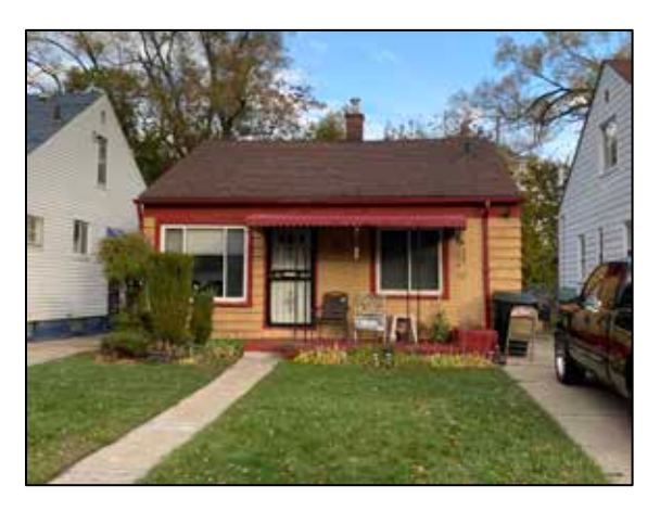
Minimal Traditional – One-story – 18642 Conley Street (1953)

the majority of homes pictured are of modest proportions with minimal detailing, thus making them more affordable for every American. This side-gable, one-story brick veneer dwelling follows the pragmatism of the time period. It has a brick chimney on the east side, a front porch, a tripartite front picture window, and a prominent gable-front portion with a simple double-hung window and contrasting siding.