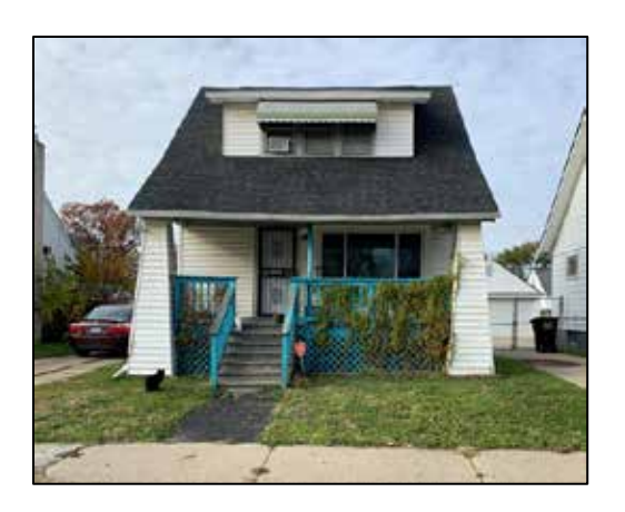
Craftsman - 18815 Syracuse Street (circa 1920)