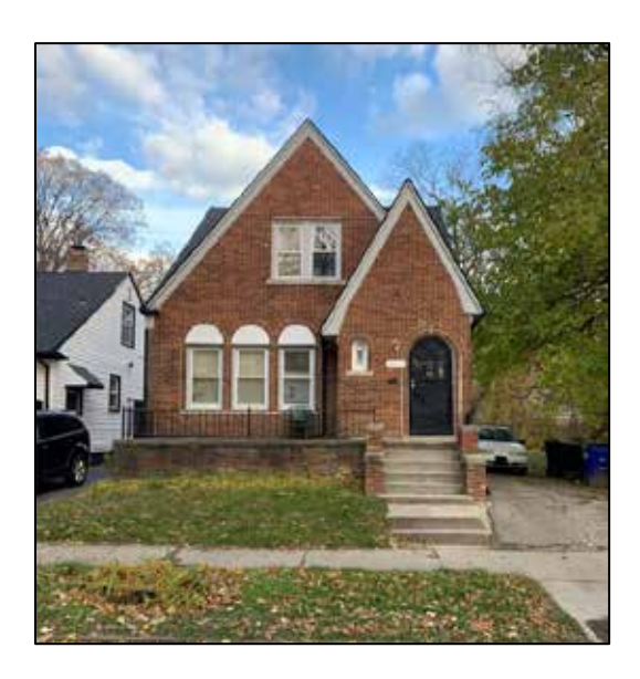
English Tudor Influenced - 18630 Shields (circa 1930)

This frame two-story dwelling was built in 1923 (permit #13081) and is an example of the Arts and Crafts style. The home is built on a basement of concrete block. The house has a high-pitched side gable with a for-shortened western façade roof. The house is faced with white vinyl siding. A wood porch runs length of the principal façade (the east façade), supported on each side by battered columns. The wood railing porch is sheltering the off-center entry door and a triple window with steel casements. The roofline is punctured by the shed roof dormer, a flat-roof dormer that projects from the gable. The gable is covered with white vinyl siding and the window is sheltered by an aluminum projecting awning. The dormer window composed of a set of three steel casement windows. The north façade has a projecting three-sided oriel window at the first story. The rear façade (the western façade) has an enclosed rear porch with a high-pitched roofline. The southern façade has a doorway facing the driveway, and the second-story window has an aluminum awning. The roof of the house is sheathed with dark grey shingles.