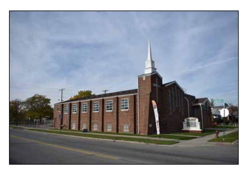
King David Missionary Baptist Church - 18001 Sunset Street (1969, 2004)