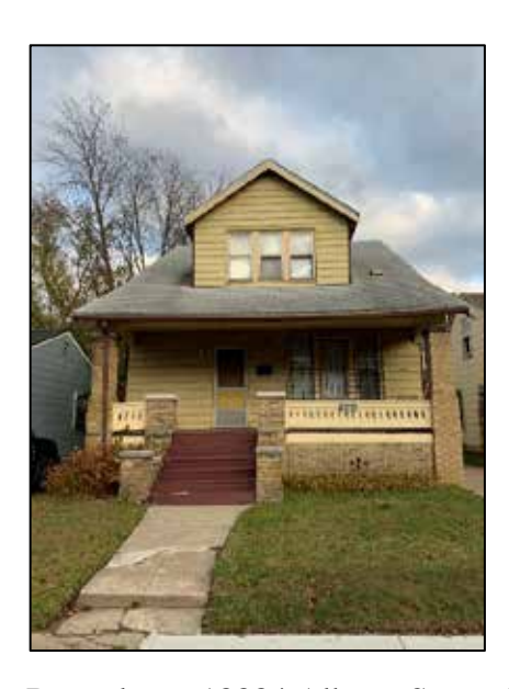
Bungalow - 18884 Albany Street (1927)

The units are grouped in identical pairs, sited as opposite reflecting plans. The rear of the townhomes have a similar alcove entrance, and the windows and doors are also brown aluminum. The utility boxes are on the exterior of the end units. The side facades are faced in brick, include a brown casement aluminum window, the side of the gable has wood panels, also painted a light peach color. There are two, three, and four-bedroom townhouses in the Sojourner Truth Homes site. A variation among the townhouses is a one-story Americans with Disabilities Act (ADA) compliant addition on some of the townhouse buildings. These units have a concrete entry ramp. Because of the different-colored brick on the ADA units, it is likely that these were a later addition.