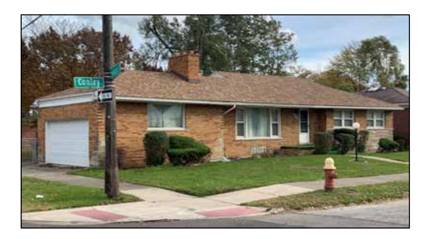
Ranch - 18510 Conley (1953)

The center entrance door has a white metal screen door and two full-height sidelights. The limited details on the house are derived from the American "colonial" period; details such as the two dormers, and the front window is given importance by the addition of shutters on each side. There is a front concrete sidewalk and a concrete driveway at the south side of the home. There are many variations of Cape Cod homes in Krainz Woods.