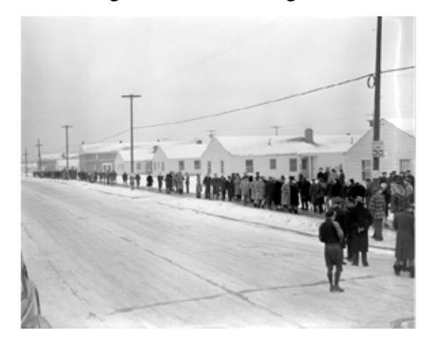
Sojourner Truth Homes protest February 28, 1942

The racial attack at the Sojourner Truth Homes was covered in the New York Times , Life magazine, and Time magazine; the most significant national news sources of the 1940s. Additionally, the