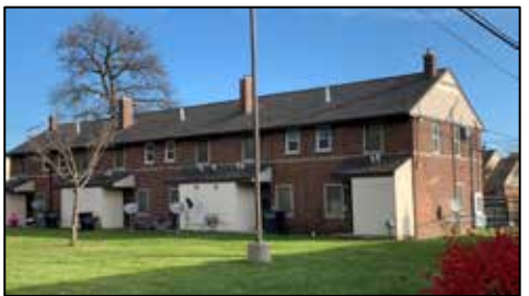
<u>Minimal Traditional Rowhouses - Sojourner Truth Homes – 4801 East Nevada Avenue (1941)</u>

There are twenty (20) of the original 1941 rowhouse buildings remaining on the Sojourner Truth Homes site. Each building has six bays and contains six individual units. The two-story rowhouses are built on a concrete slab and have no basement. These original Sojourner Truth rowhouse structures are side-gabled, faced with dark red brick, with a beige-colored brick string course. The string course runs around each building along the lower edge of the second-story windows. The dark red brick is laid in a running-bond pattern. The Minimal Traditional style of the rowhouses reflects the form of traditional houses but omits their decorative detailing.