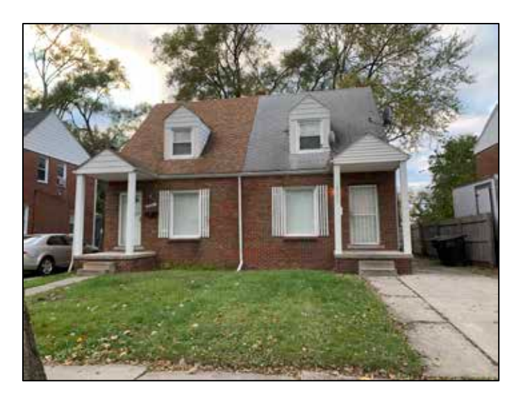
Two-family Cape Cod – 18667 and 18671 Sunset Street (1948)

Initial residents: 18667 Sunset – Calvin Miller