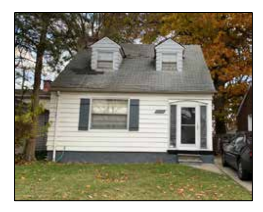
Neocolonial - Cape Cod - 18706 Bloom Street (1940)

The one-story dwelling at 18642 Conley Street was constructed in 1953 (Detroit City Building Permit #12549). This side-gable brick and wood sided dwelling expresses architectural characteristics of a simplified traditional house, including its chimney at the center of the roofline, the off-center entry door, and vertically divided white vinyl windows. Other elements, however, reflect the period such as the simple eaves, a concrete front porch and an aluminum awning over the porch. Window surrounds, the concrete porch, downspouts, and gutters are painted a light red color. The brick and wood siding at the corners of the house are painted a golden yellow. There is a side entrance adjacent to the driveway at the south side of the house. The roof is sheathed with dark red shingles. A variety of shrubbery is at the front (west façade) foundation. Houses of this type became popular starter homes in the late 1930s and early 1940s. Their blend of traditional elements with low cost proved to be an appealing combination for young families building homes in Krainz Woods.