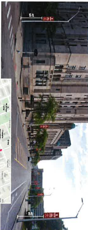
STREETVIEW POINT 'A'

LIGHT POLE BANNER 24x60 in. 2-sided Illuminated Vinyl