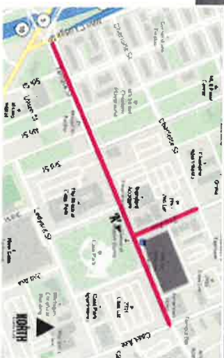
DESIGNATED LIGHT POLE STREET MAP