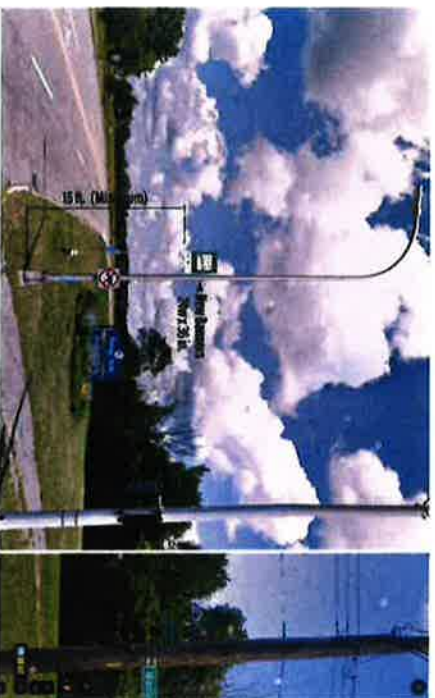
STREET VIEW POINT 'A'