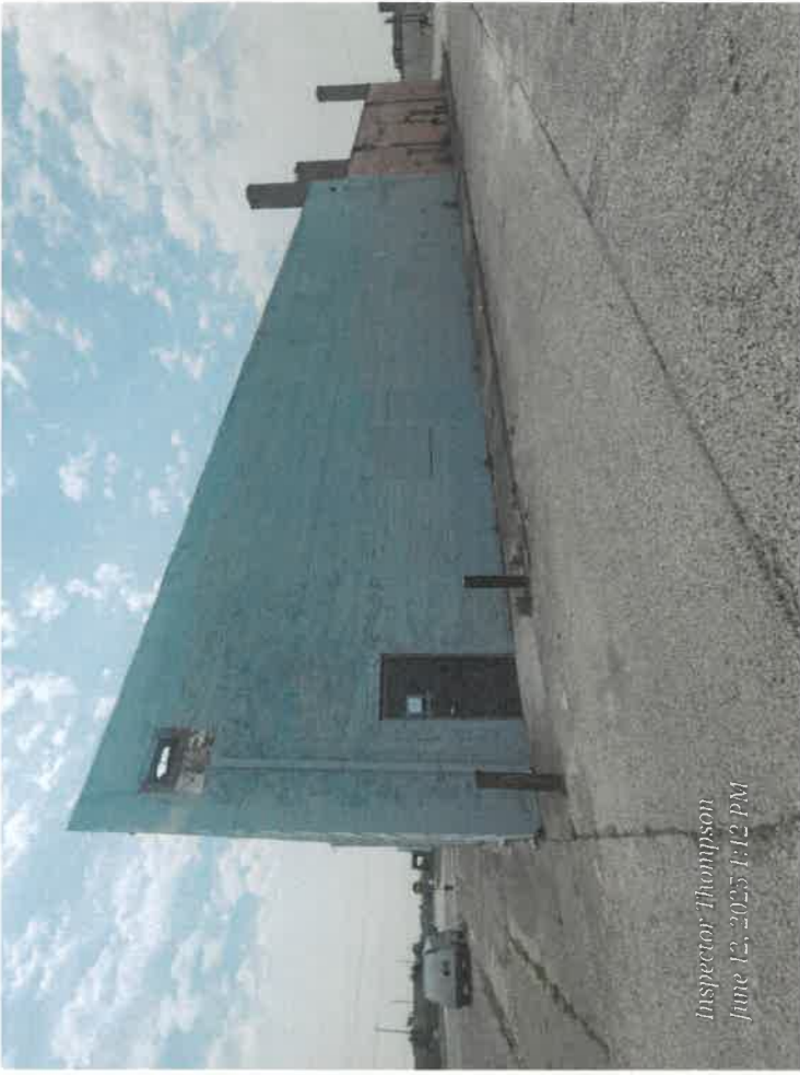
Inspector Thompson June 12, 2025 1:12 PM