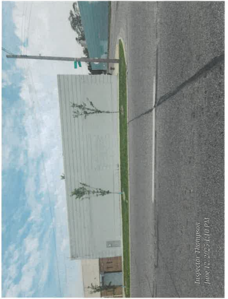
Inspector Thompson June 12, 2025 1:10 PM