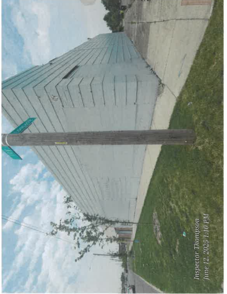
Inspector Thompson June 12, 2025 1:10 PM