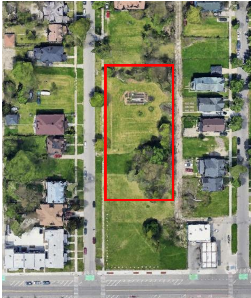
Existing site as viewed from an aerial perspective.

Bellevue Village is a multi-site affordable housing development in the Islandview Village neighborhood. The name pays homage to both the Islandview neighborhood and Belle Isle due to their close locations to the site. The development consists of three sites: Parcels A, B, and C. However, the primary focus of this rezoning request is Parcel A, a 0.77-acre site on the east side of Field Street, north of Kercheval, where a 29-unit apartment building is proposed. Rezoning is required because the current R2 zoning classification does not permit multifamily developments exceeding eight units. The proposed building will include 29 affordable rental units, with a mix of: