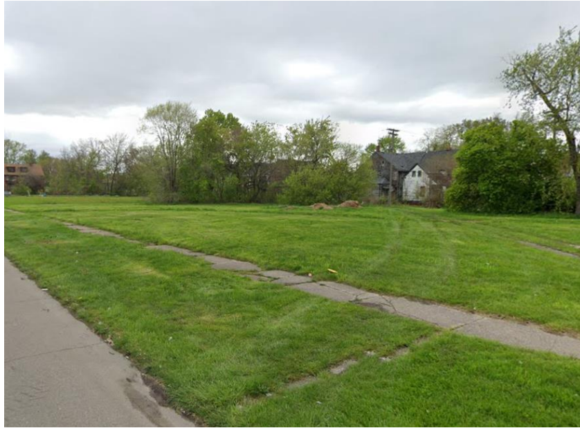
Existing site as viewed from the corner of Field Street and Kercheval Avenue (looking northeast).