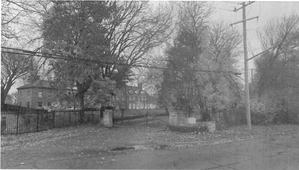
HAMILTON ROAD & PONTCHARTRAIN BOULEVARD STREETVIEW