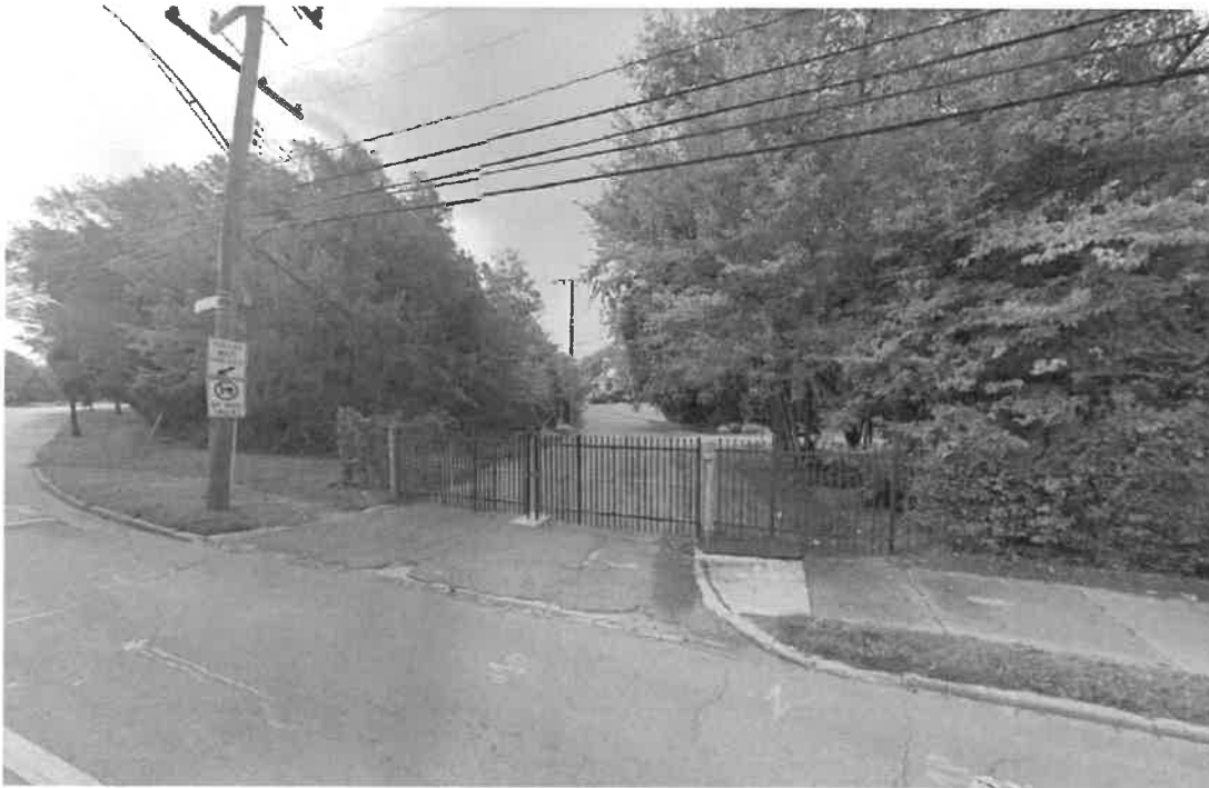
HAMILTON ROAD & W. SEVEN MILE ROAD STREETVIEW