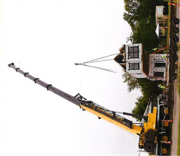
TOMMOROW'S HOUSING INNOVATION SHOWCASE