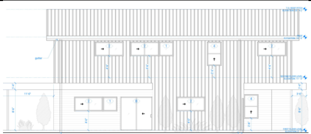
1 north elevation