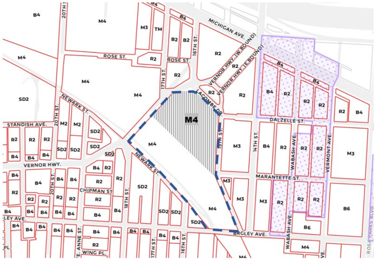
Rezoning shown within hashed line. The shaded-striped area is proposed to be rezoned from M4 to B5.