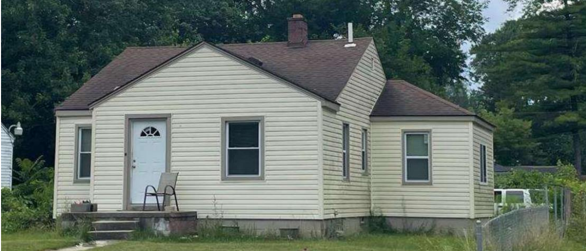
Undated Historic Designation Advisory Board photo.

STAFF REPORT: MARCH 13, 2024, REGULAR MEETING PREPARED BY: PLANNING AND DEVELOPMENT DEPARTMENT STAFF PROPOSED DEF SOUND STUDIO HOUSE HISTORIC DISTRICT FINAL REPORT ADOPTED BY HISTORIC DESIGNATION ADVISORY BOARD: FEBRUARY 8, 2024 DRAFT ELEMENTS OF DESIGN ADOPTED BY HISTORIC DESIGNATION ADVISORY BOARD: FEBRUARY 8, 2024