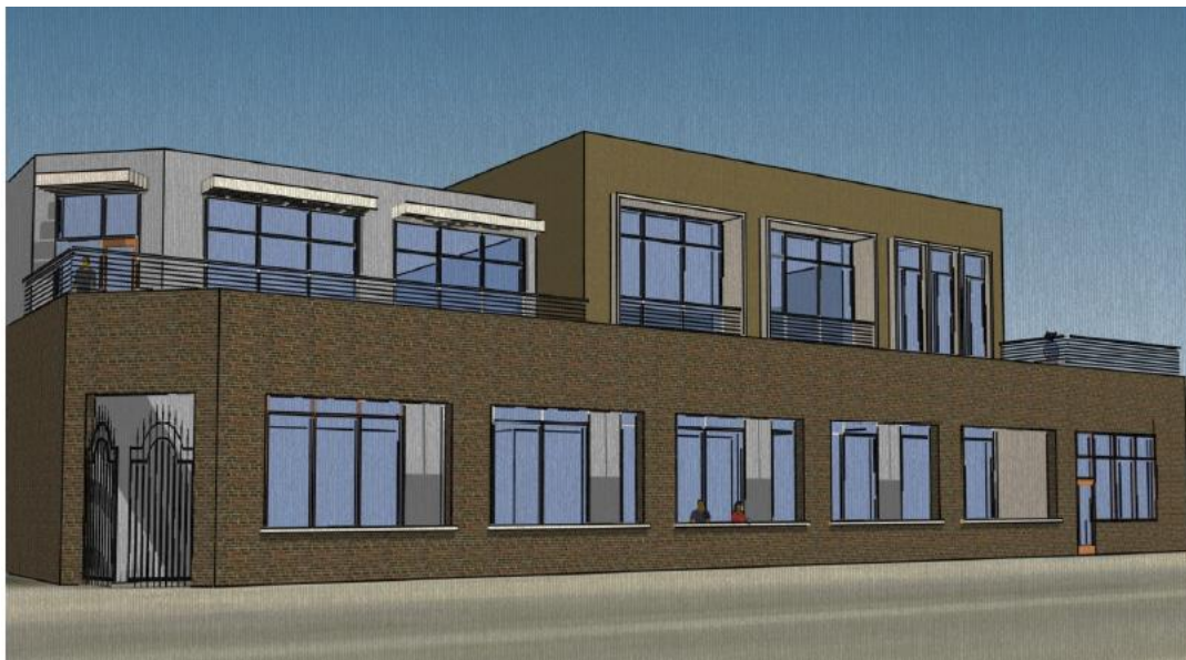
Rendering of completed project at 7326 W McNichols 8