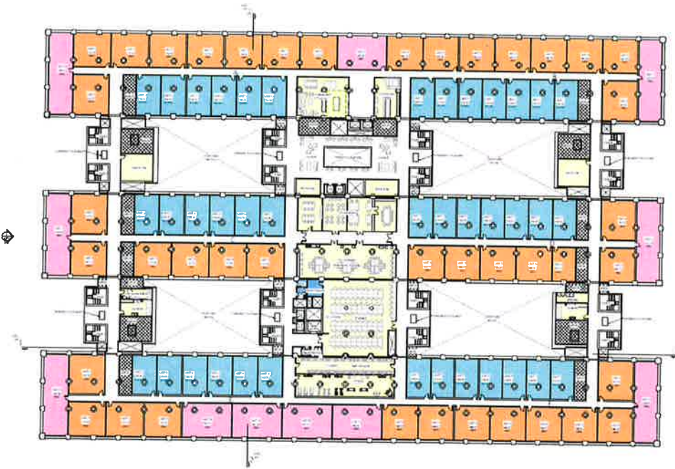
FIFTH FLOOR PLAN 10/10/10