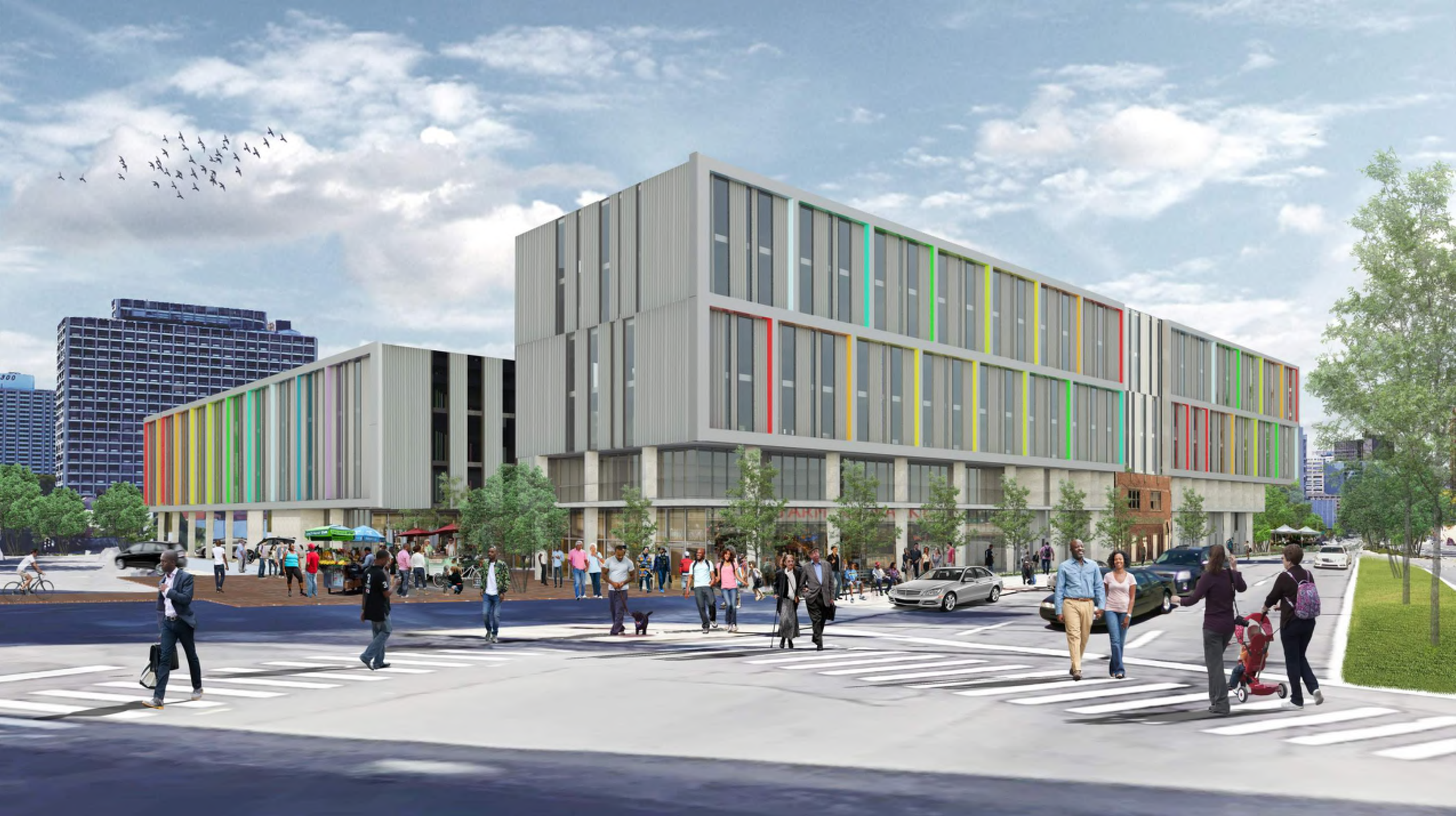
VIEW 1 : RUSSELL - GRATIOT INTERSECTION