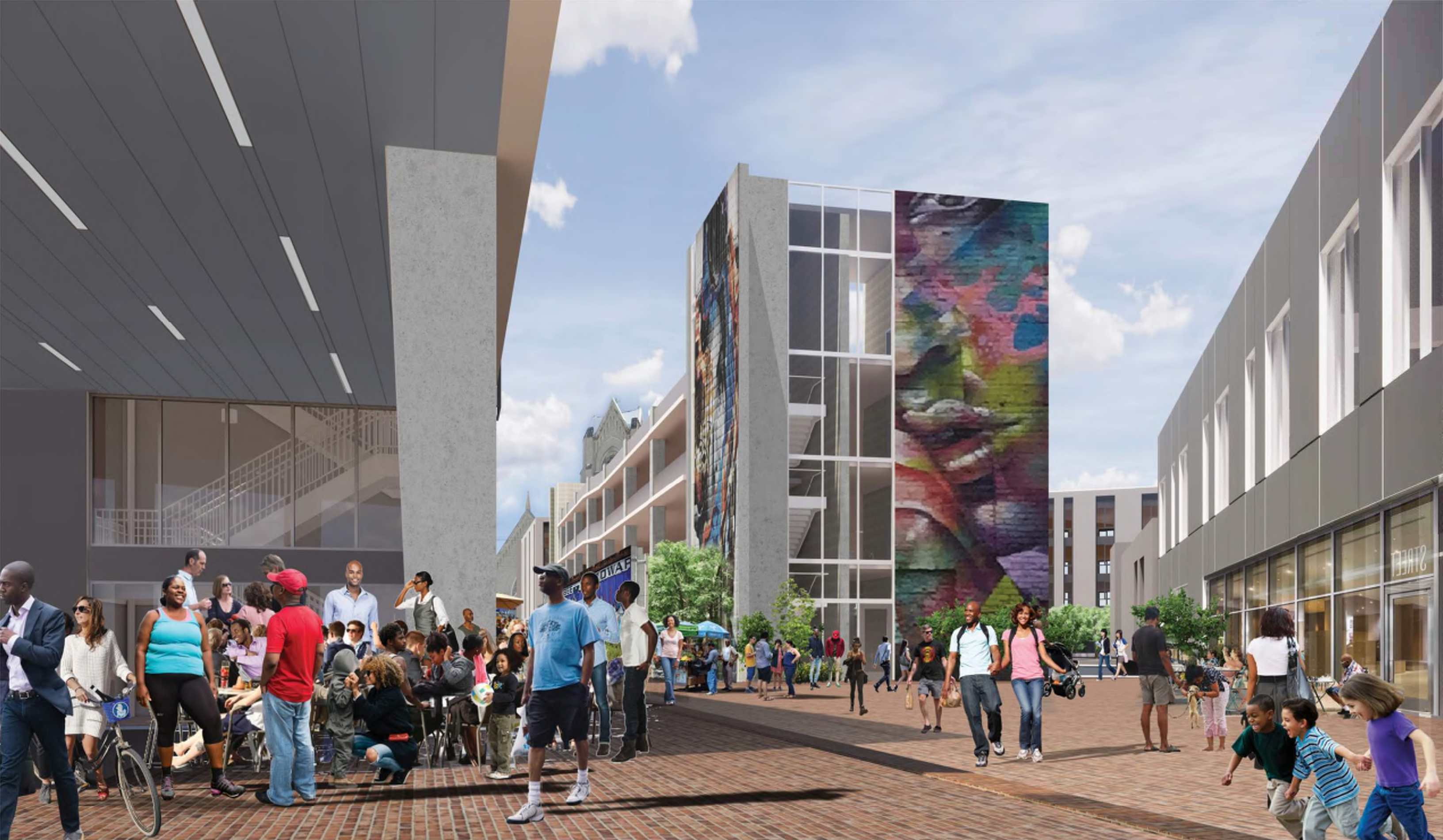
VIEW 2 : PIAZZA VIEW