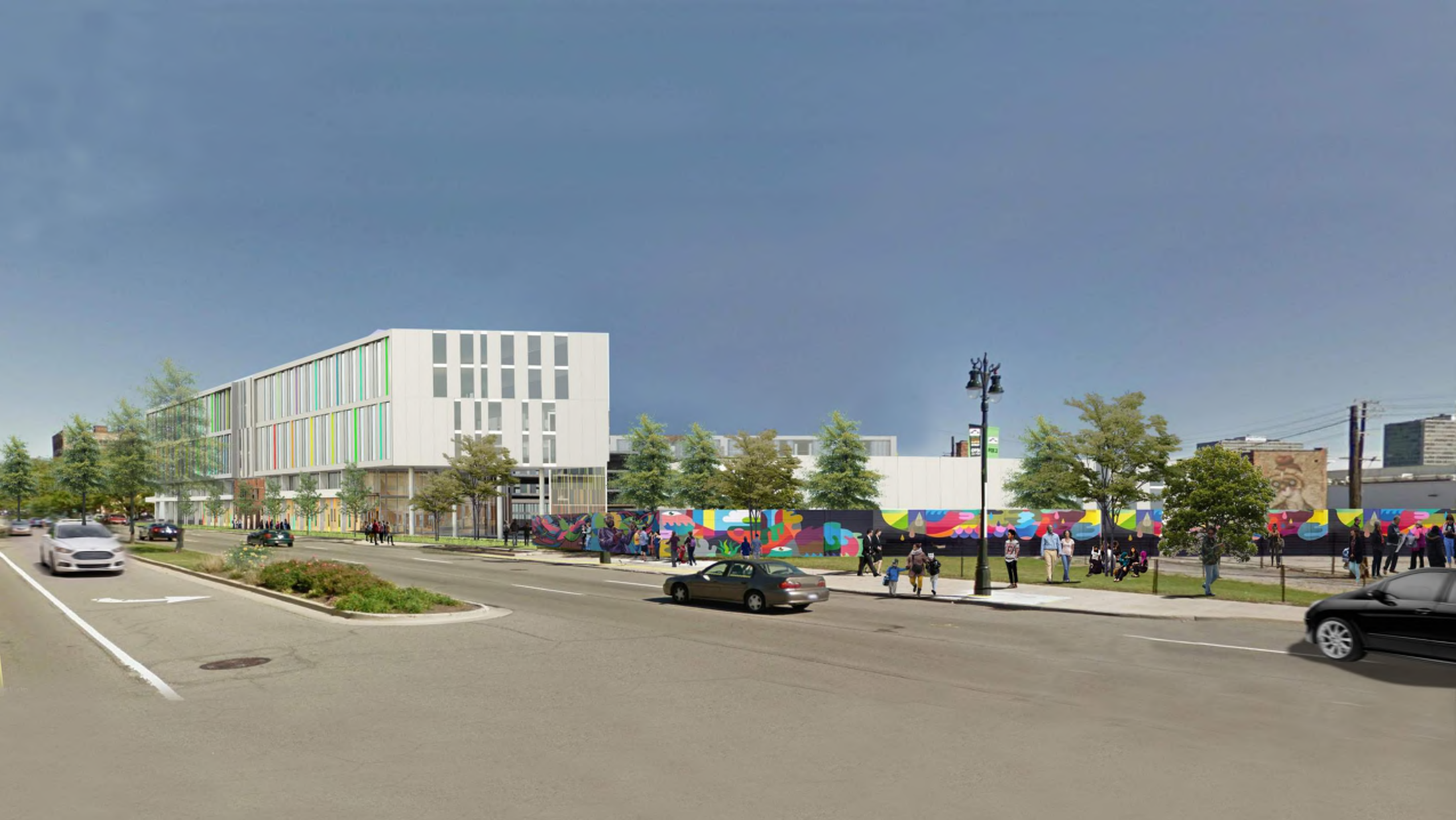
VIEW 5 : VIEW FROM GRATIOT LOOKING EAST