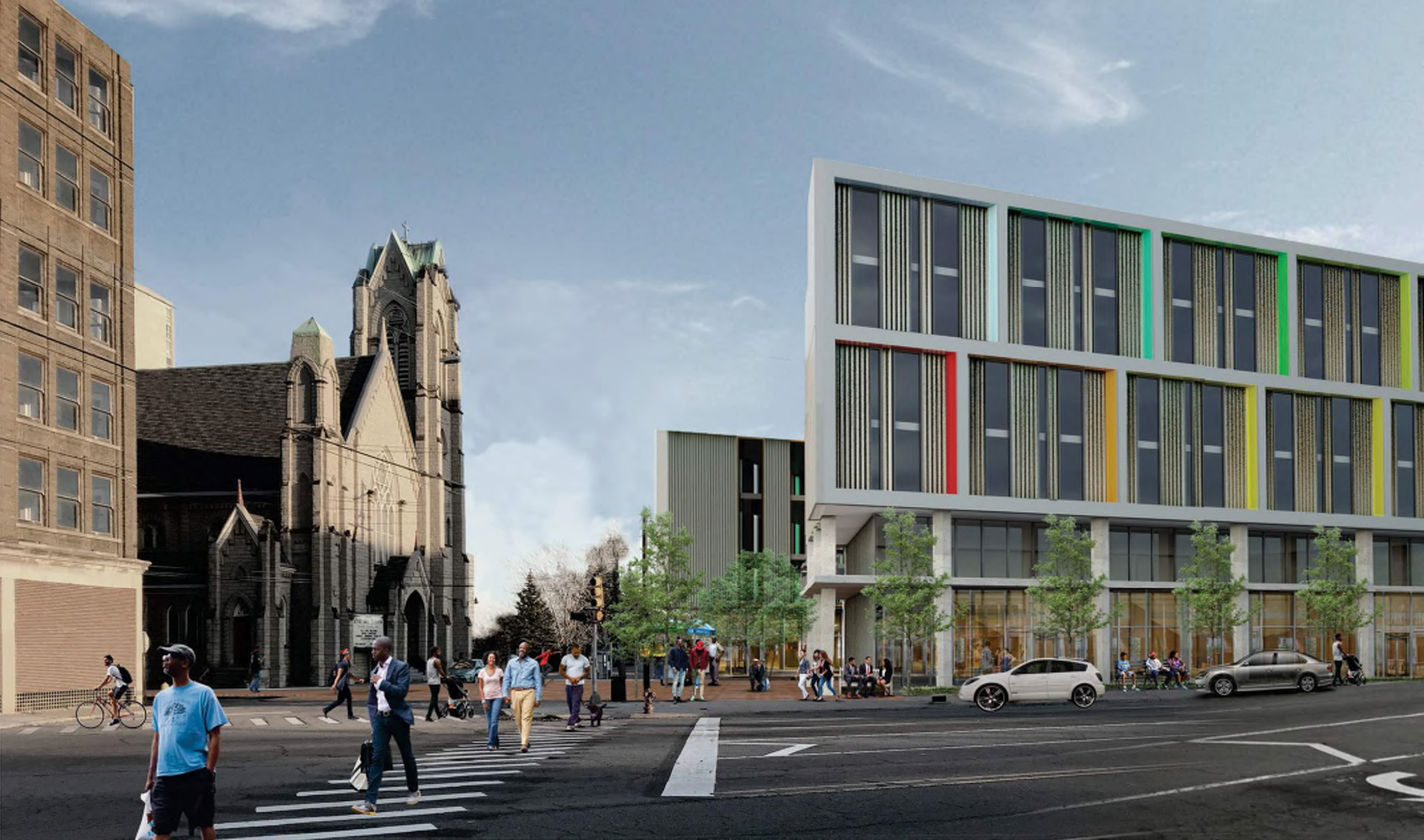
VIEW 7 : PLAZA AT GRATIOT AVE CORNER AND RUSSELL STREET