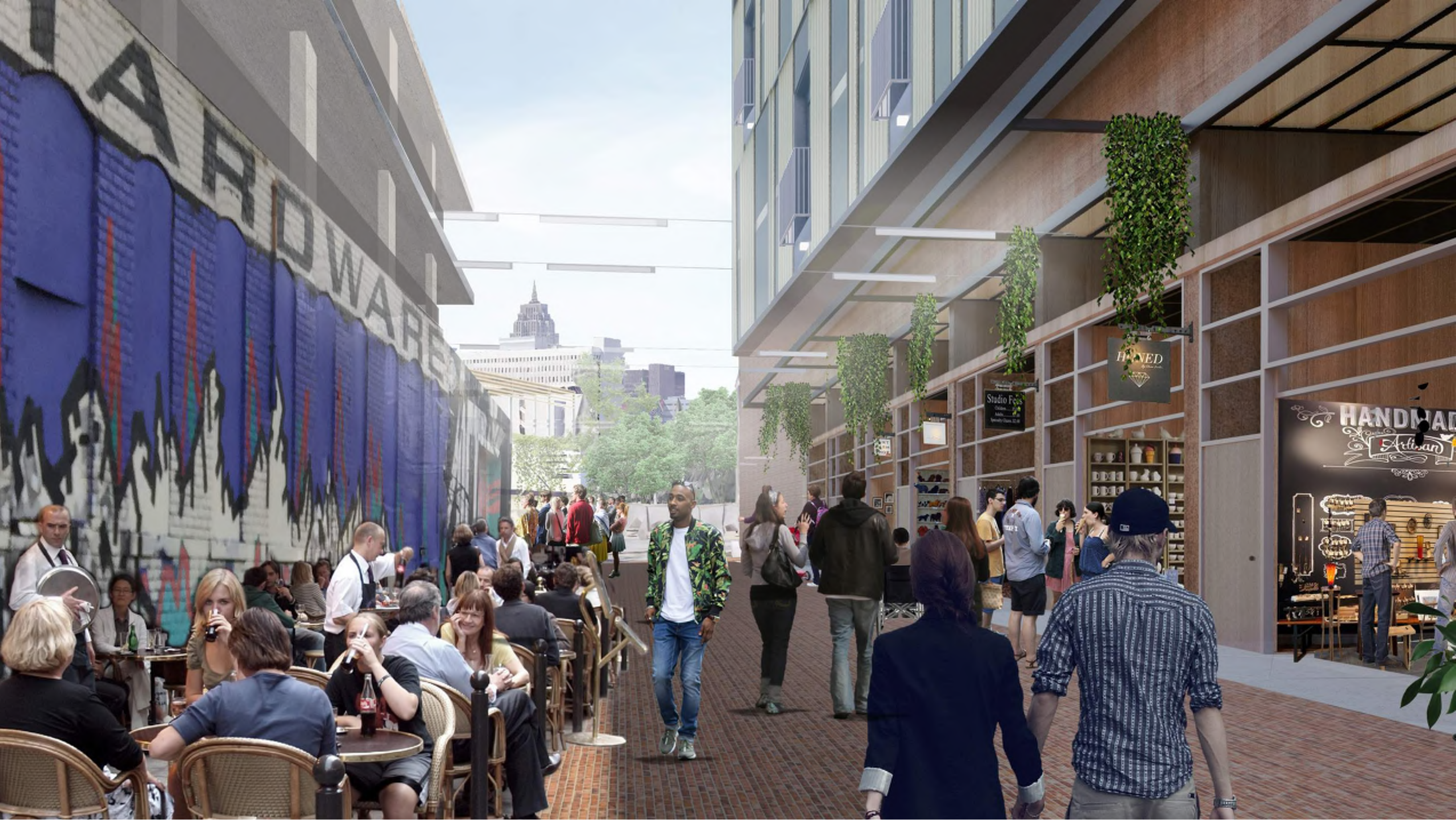
VIEW 6 : SERVICE STREET LOOKING WEST