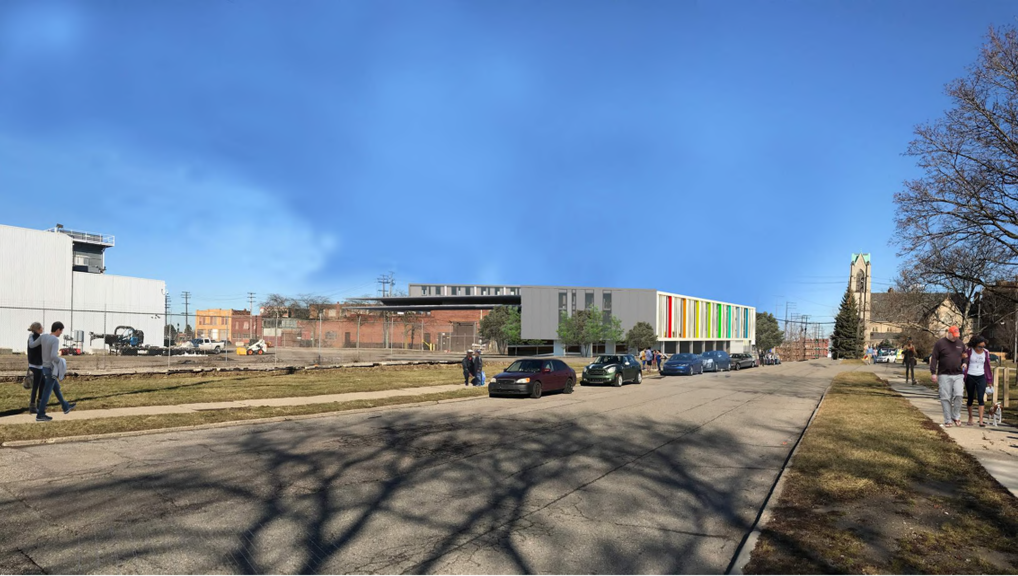
VIEW 4 : RUSSELL BUILDING VIEW FROM RUSSELL STREET