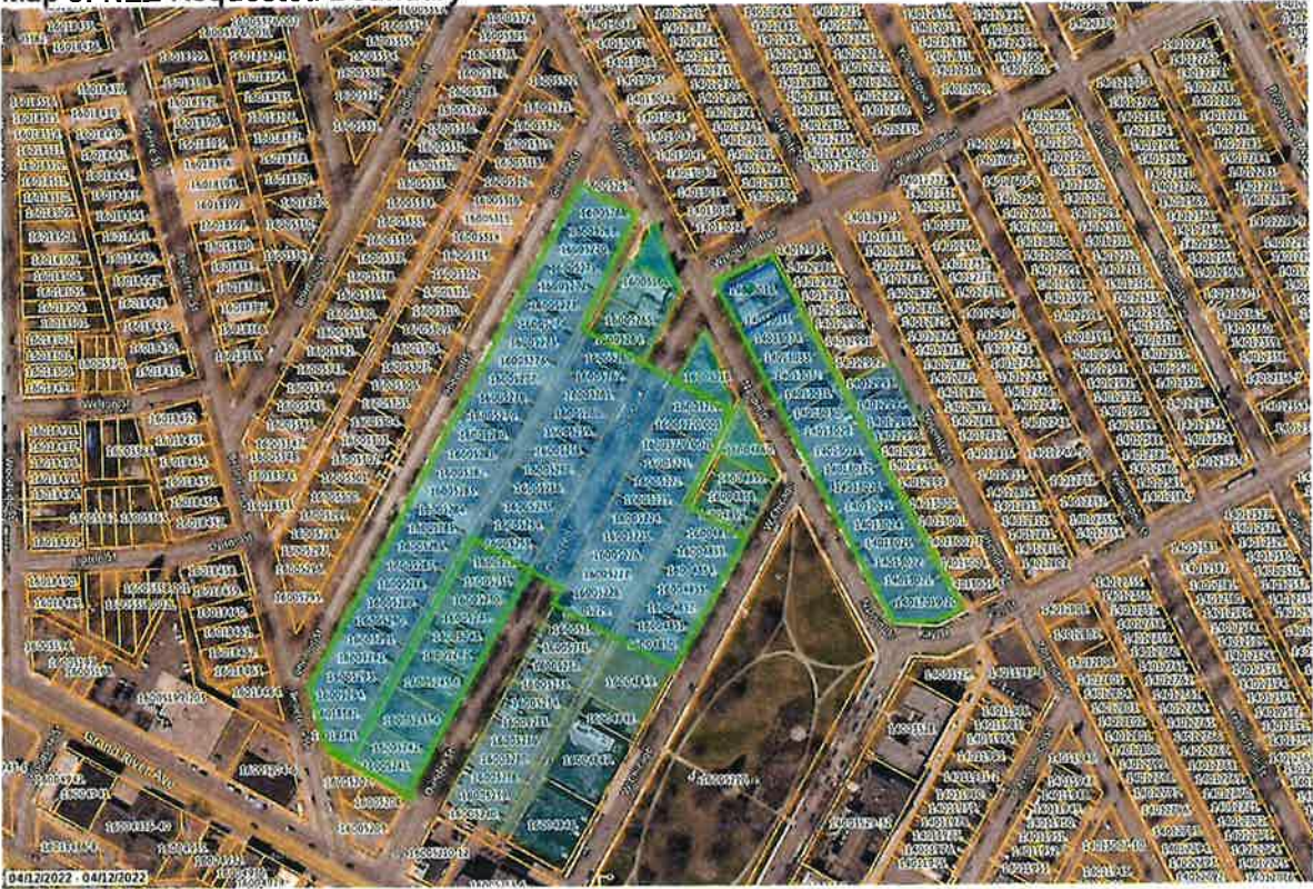
Map of NEZ Requested Boundary